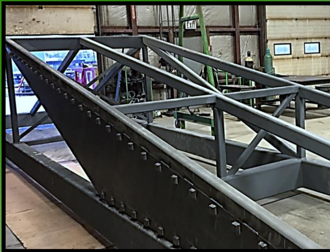
Welding & Fabrication